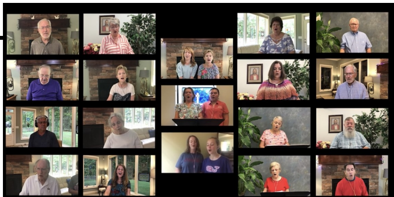
Above: Virtual Choir, "All My Hope"